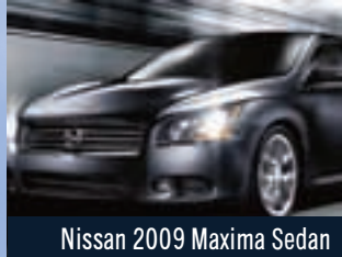
Nissan 2009 Maxima Sedan